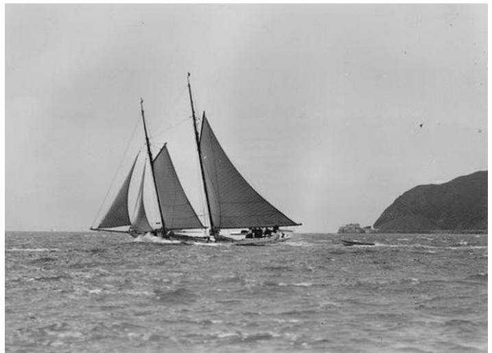
Schooner Martha sailing in San Francisco Bay before the Golden Gate Bridge was built (Marin Headlands in the background)

The primary goals of the Foundation address the vessels' stewardship, youth sail-training programs, to curate the vessel's history, allowing public access and experiential education. A Board of Directors was drawn up and 501(c)(3) non-profit status was granted. Martha was placed on the National and Washington State Historic Register in 2001. **