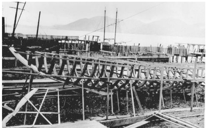
W.F. Stone Boatyard in San Francisco where Martha was built

**Many articles have been written about Martha over the years. Some articles are archived here: SMF Media Archive If you know of any media sources about Martha that aren't referenced, please share!